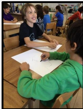
Year 6 using charcoal to draw portraits without looking at their paper.