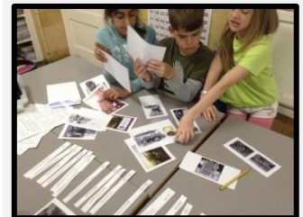
Year 4 starting their initial investigations into the history of Portobello road.