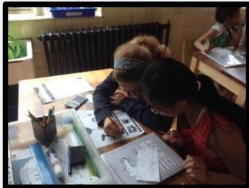
Year 5 working out how much energy they have used at home.