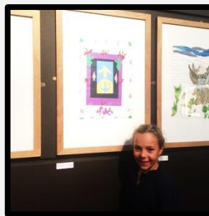
Yr 6 art competition winners at Leighton House.